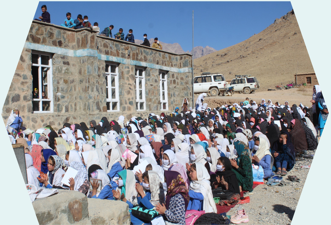
Celebrating Global Hand Washing Day in Kiti District