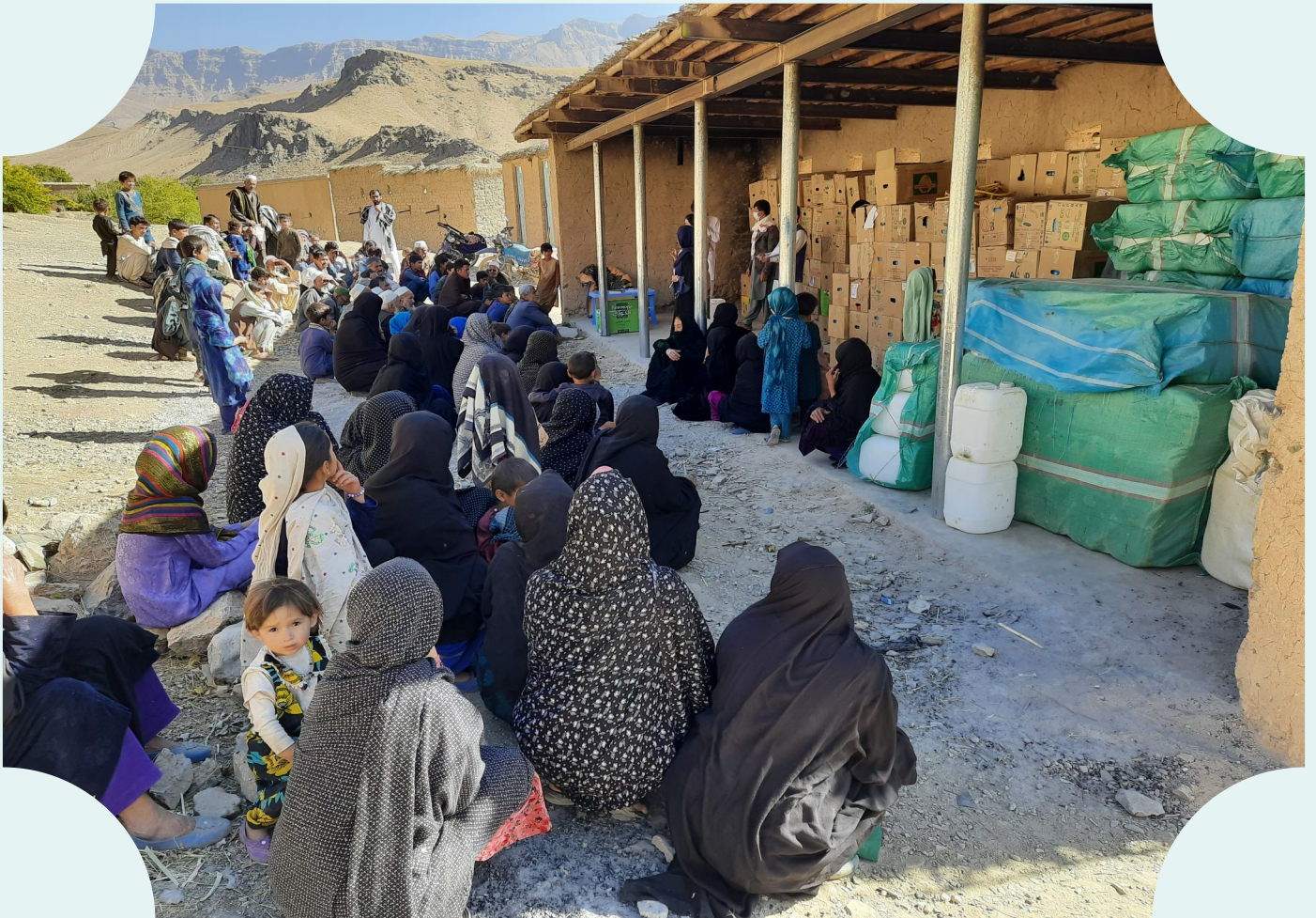
Distributing Hygiene kits to the Beneficiaries